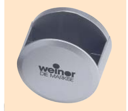
Remoto wall holder

It controls 5 receivers (e.g. 5 awnings) or 5 groups of receivers (e.g. 5 groups of awnings) individually or at the same time.