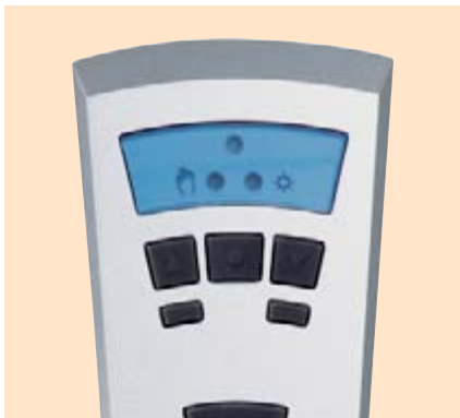
WeiTronic Remoto 1M

This gives the remote control unit a permanent home on the wall.