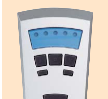
WeiTronic Remoto 5

It controls 1 receiver (e.g. an awning with WeiTronic Combio-868 MA ) or a group of receivers (e.g. dimming function for lighting or heating).