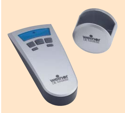
WeiTronic Remoto 1 with wall holder