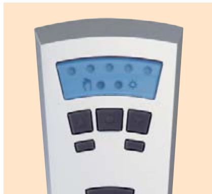
WeiTronic Remoto 5M

It controls 1 receiver (e.g. an awning with WeiTronic Combio-868 MA ) or a group of receivers (e.g. dimming function for lighting or heating), and, in addition, it activates or deactivates the sun sensor WeiTronic Lumero-868 or the sun and wind sensor WeiTronic Aero-868 .